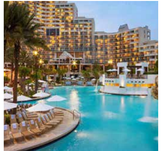
Housing & Conference Center