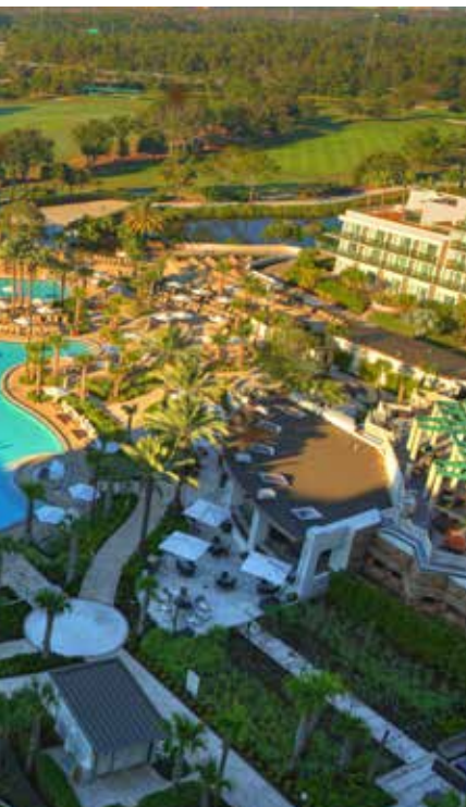
Housing & Conference Center